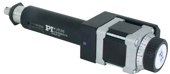
M-235.22S high-resolution Stepper-Mike, 20 mm travel range, ballscrew