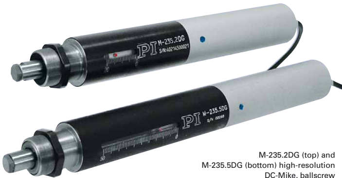
M-235.2DG (top) and M-235.5DG (bottom) high-resolution DC-Mike, ballscrew